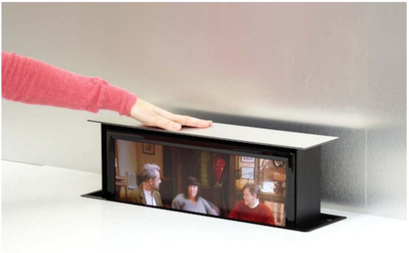
S-Box™ – a revolutionary new storage concept for the kitchen