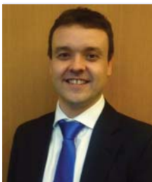
Stephen McParland, MP

The All Party Parliamentary Furniture Group (APPPG) provides an invaluable conduit for this dialogue and enables the industry to meet and communicate with influential politicians and civil servants.